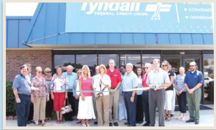
Ribbon cutting at our newest branch, 3116 Ross Clark Circle, Dothan, AL.