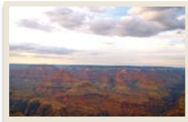
Grand Canyon National Park

To learn more about our ScoreCard® Program, visit us @ tyndall.org/scorecard