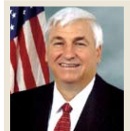
Congressman Allen Boyd

Additionally, Boyd complimented Tyndall on programs such as the 'Helping Hands' mortgage. Tyndall would like to express our thanks to Congressman Boyd for the support he has shown Tyndall and the credit union industry.